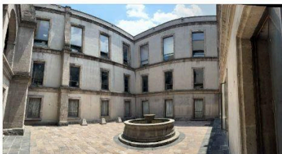
Patio de la Fuente